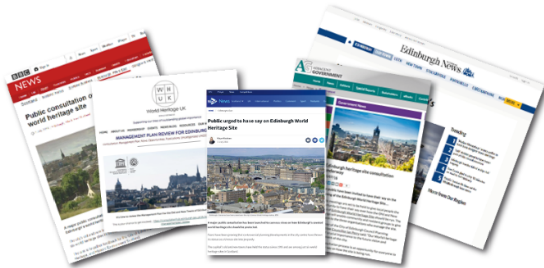
Figure 4: Online public consultation