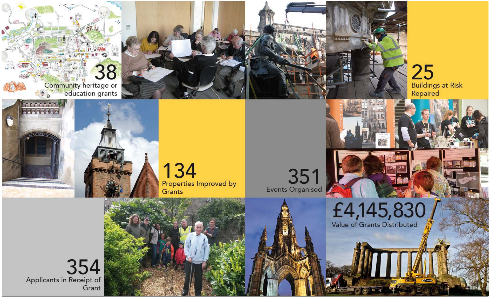
Figure 3: Impact to date of the World Heritage Site status