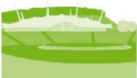
Contribution of New Developments to City Centre

However, other actions will require the formation of new partnerships and will take longer to achieve.