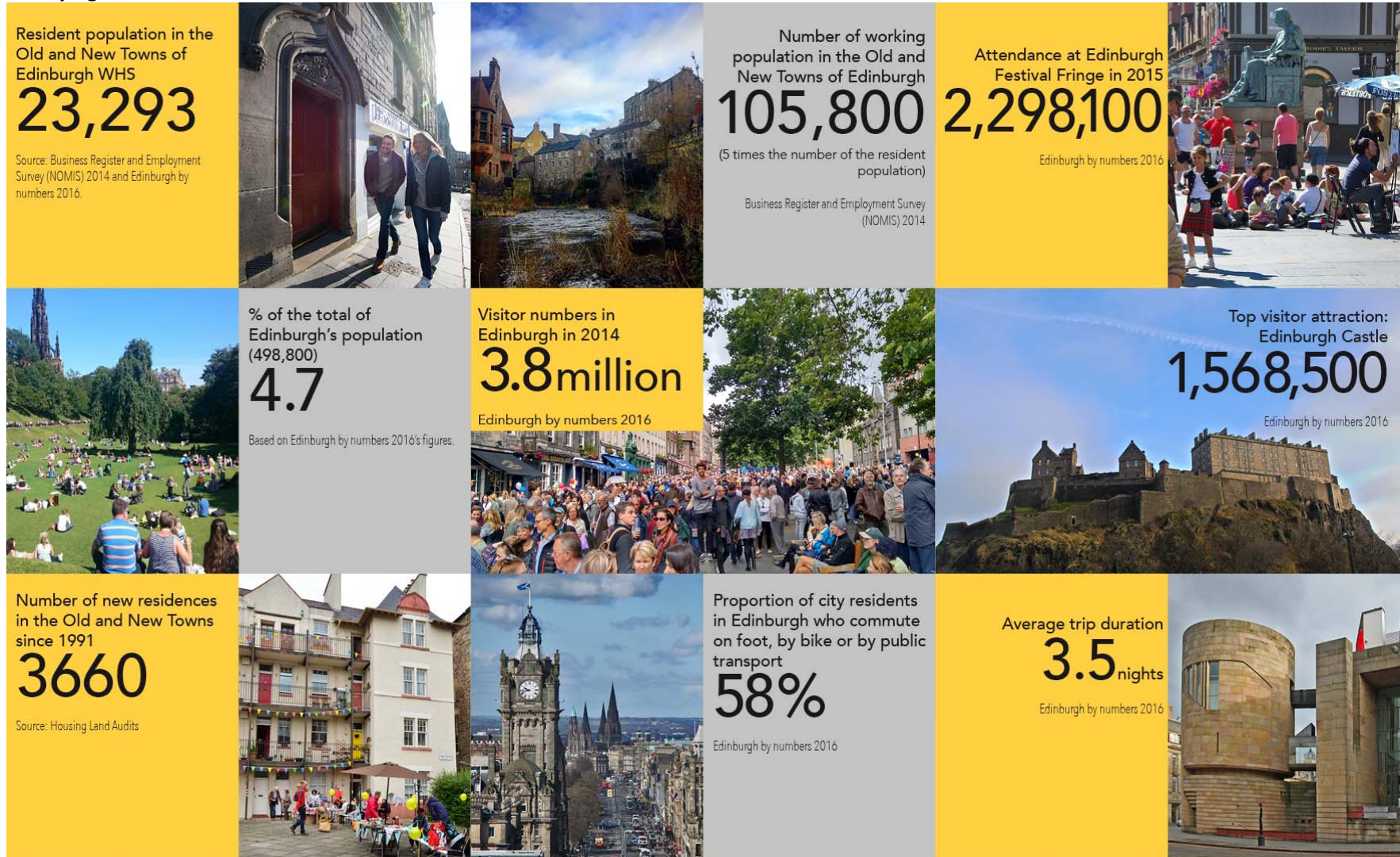
Figure 2: Key figures of the World Heritage Site